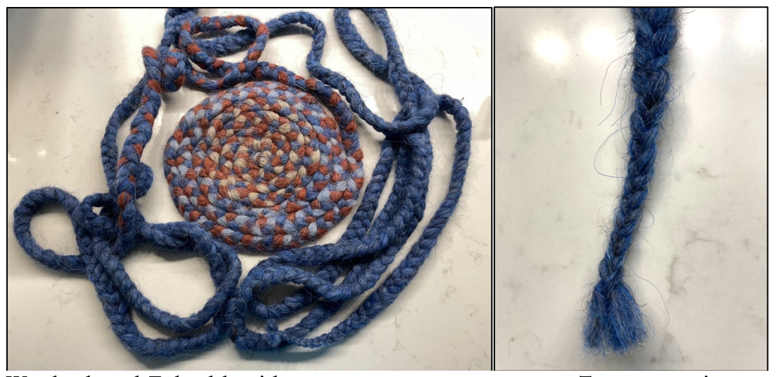
Washed and Felted braid