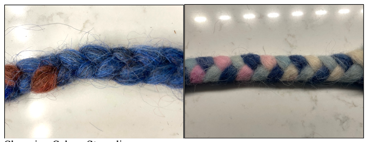
Changing Color: Stranding